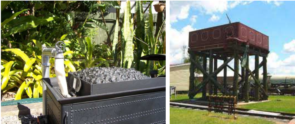
The BTR is yet to model elevated Water Tanks and yet this is the 'look' we are seeking.