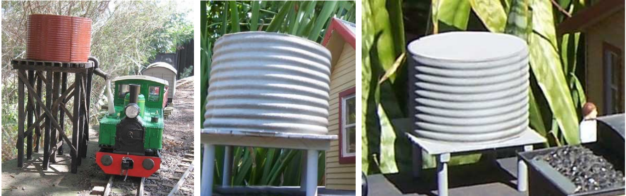
BTR Loco taking water on the S&TR.