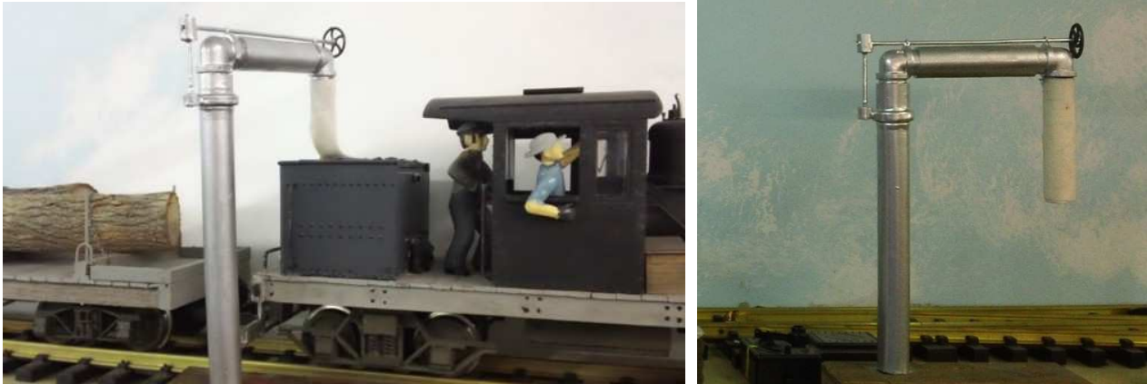
Geof's BTR Standard Water Columns are fabricated from 13mm plastic garden watering system parts.